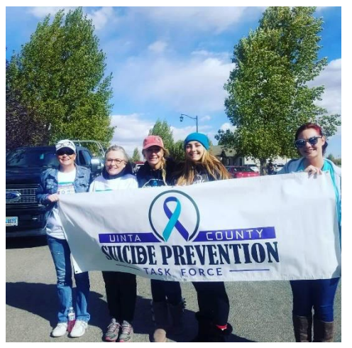
Uinta County Suicide Prevention Task Force members.