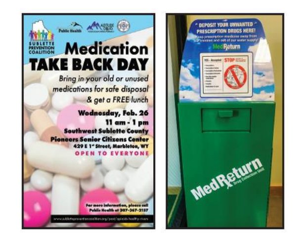
Medication Take Back Day flyer and Drug Disposal Box from the Drug Disposal Program.