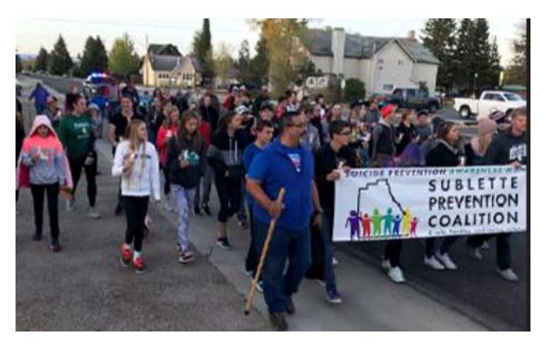
Community members walk in parade carrying Sublette Prevention Coalition sign