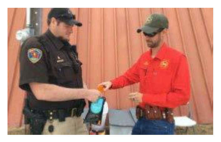
Fremont County law enforcement assisting with Deterra (drug disposal) Bags.

Fremont County Suicide Prevention Taskforce formed a board, adopted by-laws, and became a 501(c)(3).