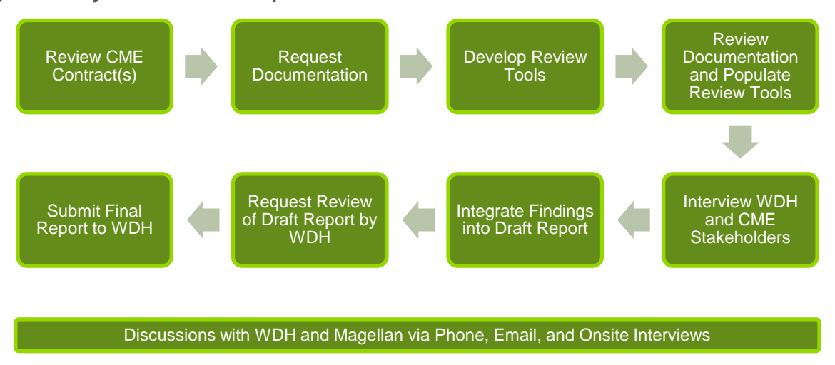
Figure 2. Key Assessment Steps

The methodology varied slightly for each mandatory activity: