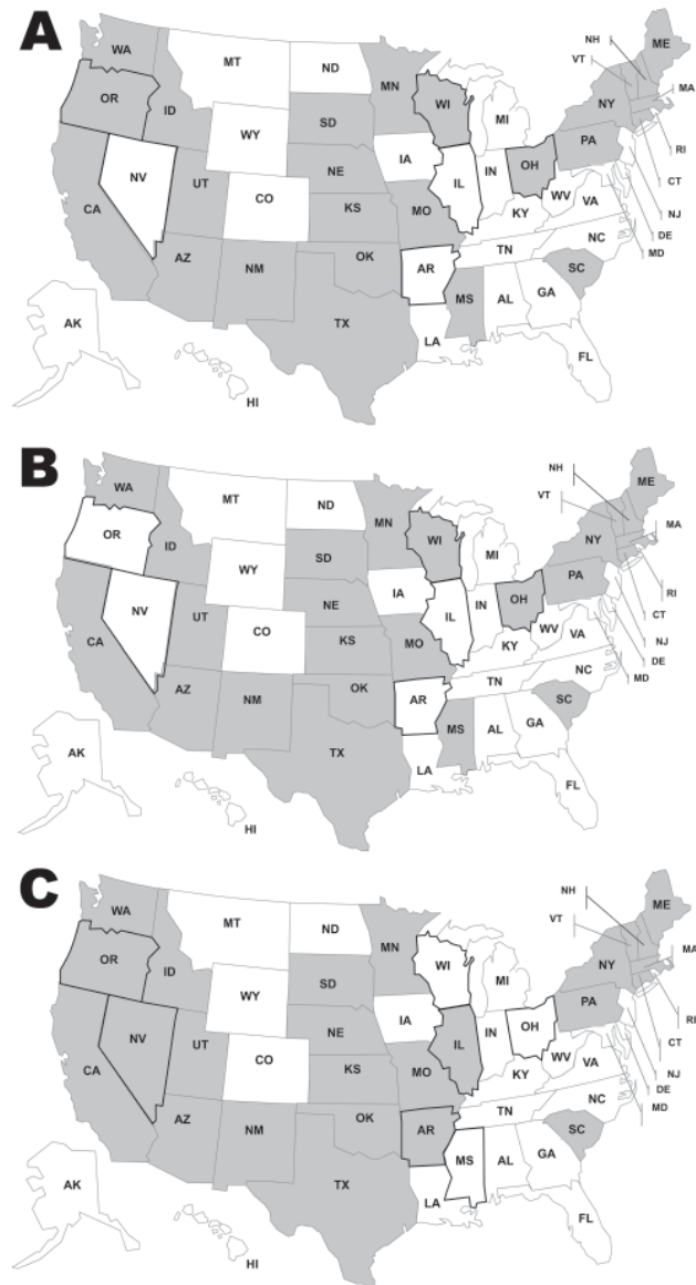
Figure 2. Legal status of nonpasteurized dairy product sale or distribution, by state, United States, for A) 1993, B) 1999, and C) 2006. Gray shading indicates states where nonpasteurized dairy product sale or distribution was permitted. States outlined in black changed legal status during the study period.

products was illegal. The source of the nonpasteurized dairy products was reported for 9 of these outbreaks: 7 (78%) were associated with nonpasteurized dairy products obtained directly from the producing dairy farm, 1 was associated with nonpasteurized dairy products obtained under a communal program to purchase shares in dairy cows (i.e., cow shares, a scheme used to circumvent state restrictions on commercial sales of nonpasteurized dairy products) (11), and 1 was limited to members of a large extended family who consumed nonpasteurized milk from their own cow.