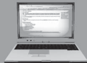
Table of contents Podcasts Ahead of Print Medscape CME Specialized topics