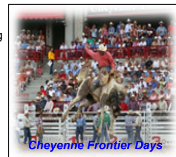
Cheyenne Frontier Days

Please visit us at : http://www.health.wyo.gov/default.aspx